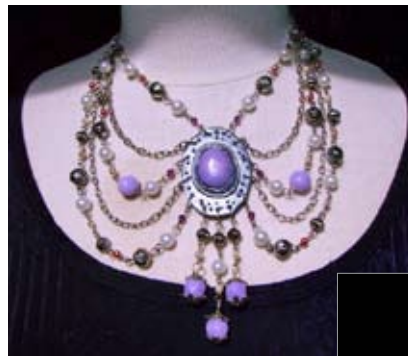
Examples of Sabine's work in medieval costume, bead and polymer clay jewellery as well as crocheted wire jewellery.